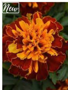
MARIGOLD BONANZA HARMONY