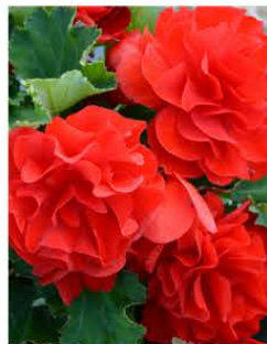
BEGONIA NONSTOP RED