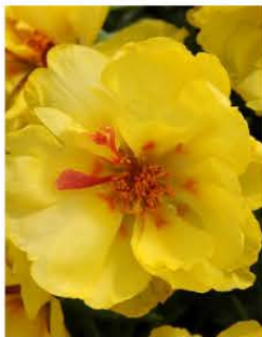
PORTULACA HAPPY HOUR BANANA

Veranda Double Sugar Plum - Fully double, medium size blooms of bicolor purple and lilac. Controlled habit, suitable for pot production as well as hanging baskets and mixed containers. Height 8-12". Propagation prohibited.