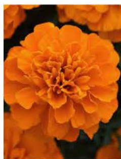
MARIGOLD BONANZA DEEP ORANGE