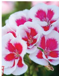
GERANIUM FLOWER FAIRY WHITE SPLASH