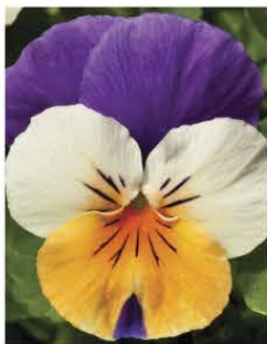
VIOLA PENNY PEACH JUMP UP