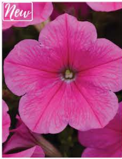
PETUNIA PREMIUM E3 EASY WAVE PINK COSMO