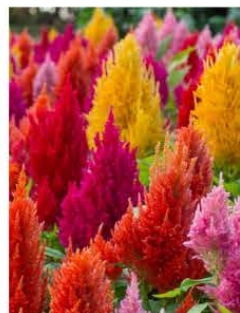
CELOSIA KIMONO MIX