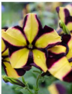
PETUNIA RAY SUNFLOWER