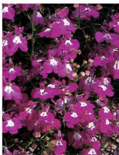
LOBELIA REGATTA ROSE