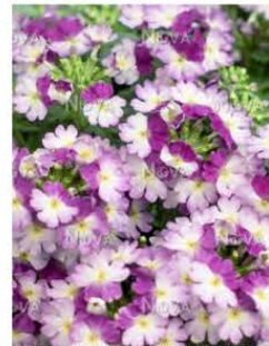
VERBENA VANESSA COMPACT BICOLOR PURPLE