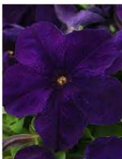
PETUNIA PRETTY GRAND MIDNIGHT