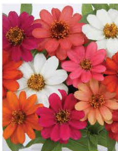
ZINNIA PROFUSION MIX

Penny - Early flowering, 6" violas display 1" blooms. Uniform in both habit and flowering, with excellent cool weather tolerance. Also displaying more plant body, this series should fill packs and pots better.