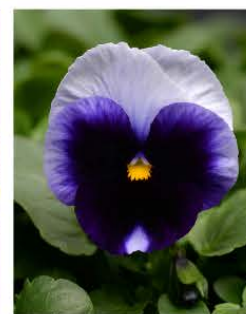
PANSY SPRING MATRIX BEACONSFIELD