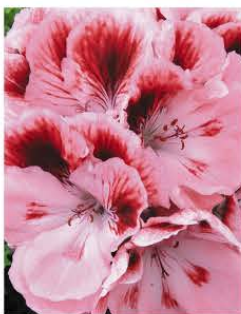
GERANIUM ELEGANCE ROSE BICOLOR