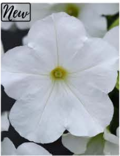
PETUNIA PREMIUM E3 EASY WAVE WHITE