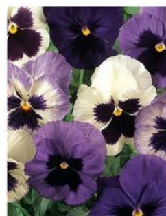
PANSY MATRIX MIX OCEAN BREEZE