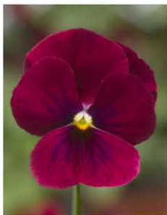
VIOLA PENNY ROSE BLOTCH