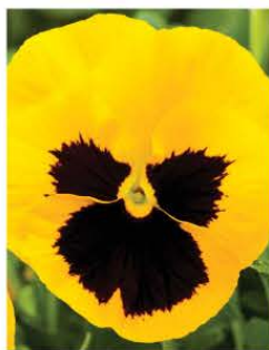
PANSY DELTA PREMIUM YELLOW BLOTCH