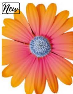
OSTEOSPERMUM GELATO PASSION