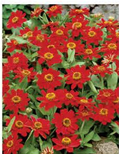
ZINNIA PROFUSION CHERRY