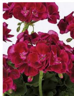
GERANIUM FLOWER FAIRY VELVET