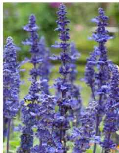
SALVIA VICTORIA BLUE