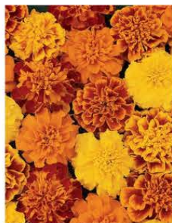
MARIGOLD BONANZA MIX