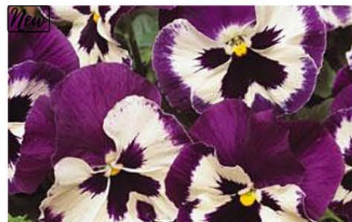
PANSY SPRING MATRIX PURPLE WHITE