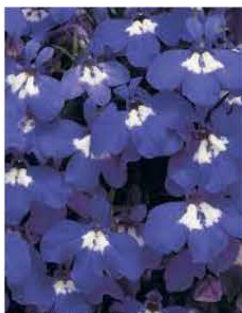
LOBELIA RIVIERA BLUE EYE