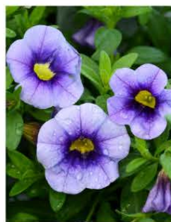
CALIBRACHOA EYECONIC PURPLE