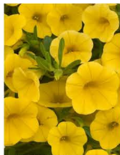
CALIBRACHOA NOA YELLOW