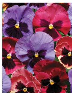
PANSY MATRIX MIX COASTAL SUNRISE