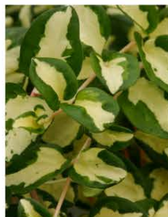
VINCA WOJO'S JEM