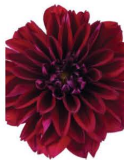
DAHLIA NOVATION RUBY