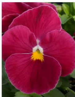
PANSY DELTA PURE ROSE