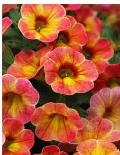
CALIBRACHOA CHAMELEON ATOMIC ORANGE