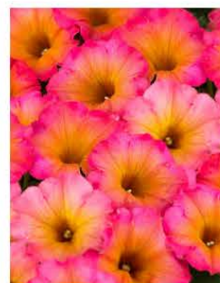
PETUNIA CRAZYTUNIA MAYAN SUNSET