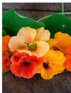
NASTURTium JEWEL MIX