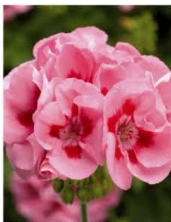
GERANIUM CALLIOPE PINK FLAME