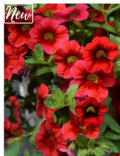
CALIBRACHOA HULA RED