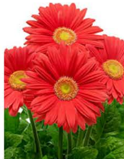
GERBERA FLORI LINE MAXI CORAL LIGHT EYE