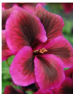
GERANIUM ELEGANCE BURGUNDY