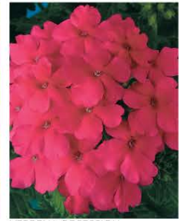
VERBENA OBSESSION PINK