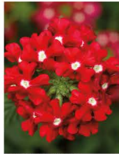
VERBENA OBSESSION RED WITH EYE

Voodoo Red Star - Red with vivid peachy-white star. (Formerly Estrella). Broadleaf verbena, selected especially for its improved mildew resistance. Compact, mounding habit, large flower cluster. Early to bloom.