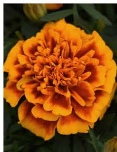
MARIGOLD BONANZA FLAME