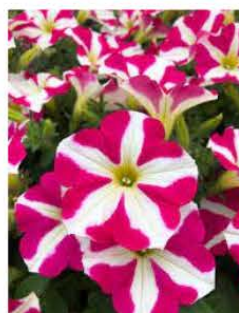
PETUNIA AMORE PINK HEART