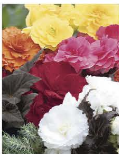
BEGONIA NONSTOP MOCCA MIX