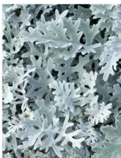
DUSTY MILLER SILVER DUST