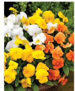
VIOLA COLORMAX CLEAR MIX