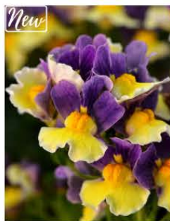
NEMESIA ESSENTIAL BLUEBERRY CUSTARD