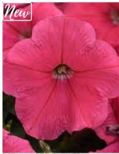
PETUNIA PREMIUM E3 EASY WAVE CORAL