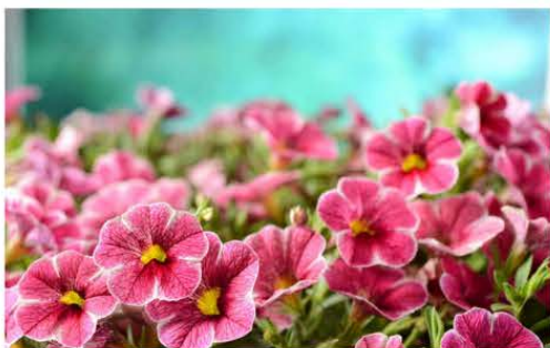
CALIBRACHOA COLIBRI CHERRY LACE