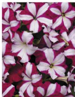
PETUNIA EASY WAVE BURGUNDY STAR