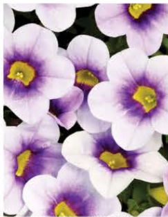
CALIBRACHOA CALITASTIC ICE BLUE