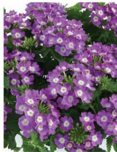
VERBENA VANESSA COMPACT VIOLET