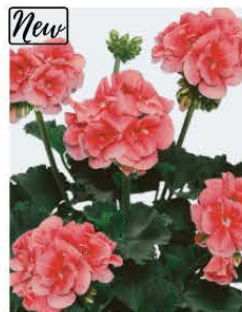
GERANIUM DARKO SALMON