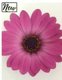
OSTEOSPERMUM GELATO CANDY PINK