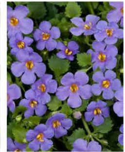
BACOPA SCOPIA GULLIVER BLUE