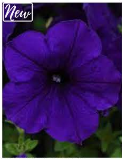
PETUNIA PREMIUM E3 EASY WAVE BLUE