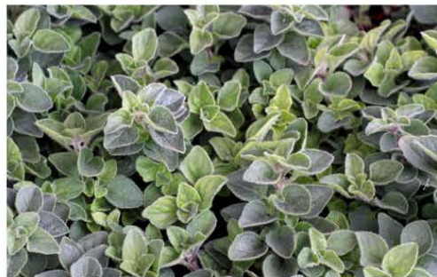
OREGANO HOT 'N SPICY