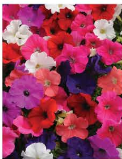
PETUNIA PRETTY FLORA MIX FORMULA