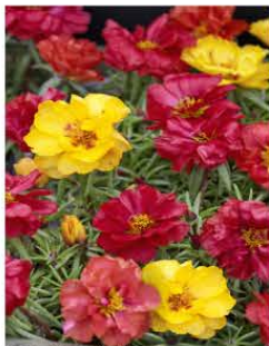
PORTULACA HAPPY HOUR MIX