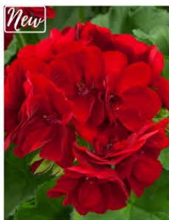
GERANIUM CALLIOPE MEDIUM BURGUNDY