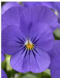
VIOLA PENNY BLUE