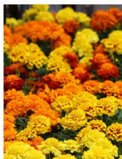
MARIGOLD SUPER HERO MIX MAXI