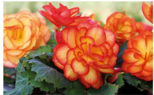
BEGONIA NONSTOP FIRE