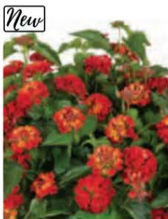
LANTANA HEARTLAND RED