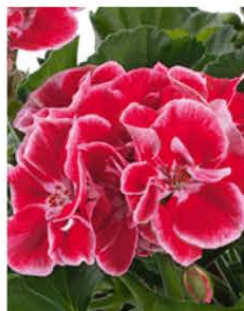
GERANIUM DARKO SPANISH WINE BURGUNDY