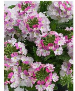
VERBENA VANESSA COMPACT BICOLOR ROSE