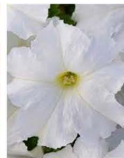
PETUNIA PRETTY FLORA WHITE