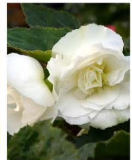
BEGONIA NONSTOP WHITE