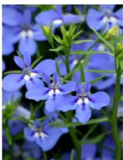
LOBELIA HOT WATER BLUE