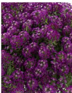
LOBULARIA STREAM PURPLE