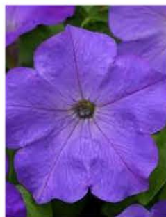
PETUNIA EASY WAVE LAVENDER SKY BLUE