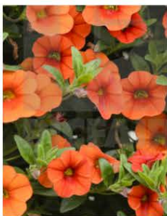
CALIBRACHOA COLIBRI ORANGE

Nonstop Mocca - Early and uniform bronze-leaved series. Numerous, large, fully-double flowers. Mounding habit and early lateral branching.