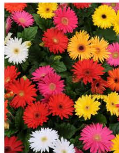
GERBERA REVOLUTION MIX SELECT