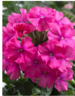
VERBENA VANESSA COMPACT DEEP PINK