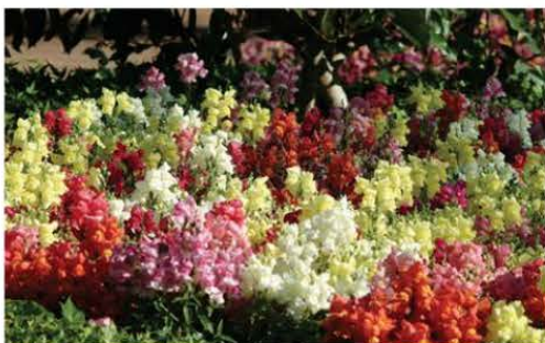
SNAPDRAGON SNAPSHOT MIX