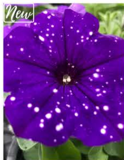
PETUNIA SPLASH DANCE BOLERO BLUE