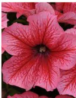
PETUNIA PRETTY GRAND SUMMER