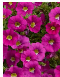
CALIBRACHOA NOA DARK PINK CARNIVAL