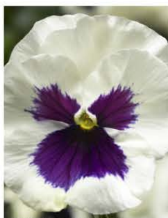
PANSY DELTA PREMIUM WHITE BLOTCH