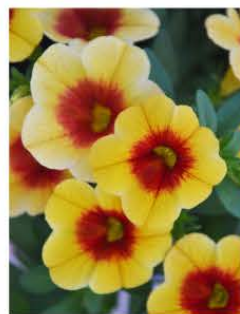
CALIBRACHOA HULA GOLD MEDAL