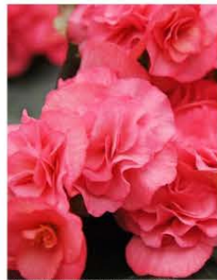
BEGONIA NONSTOP PINK