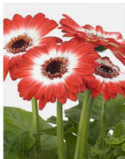
GERBERA REVOLUTION BICOLOR RED WHITE