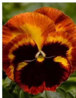
PANSY MATRIX SOLAR FLARE