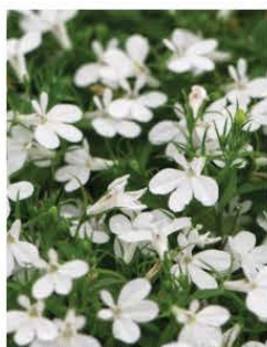
LOBELIA HOT SNOW WHITE