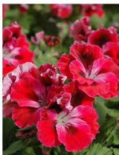
GERANIUM ELEGANCE RED VELVET