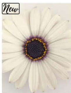
OSTEOSPERMUM GELATO ALMOND