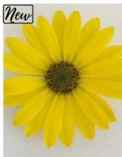
OSTEOSPERMUM GELATO PINEAPPLE