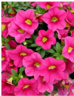
CALIBRACHOA CALITASTIC FANCY FUCHSIA