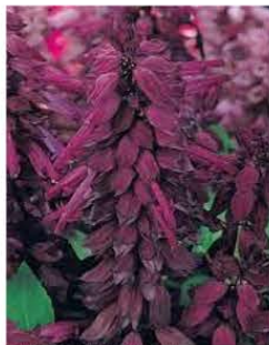
SALVIA VISTA PURPLE