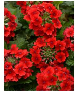
VERBENA VANESSA COMPACT RED