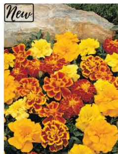
MARIGOLD DURANGO MIX