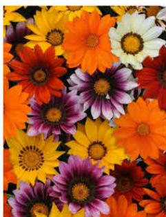
GAZANIA NEW DAY MIX