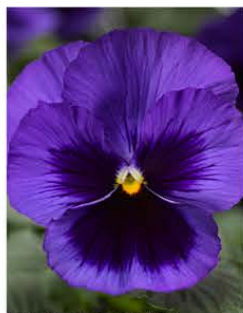
PANSY DELTA PREMIUM BLUE BLOTCH