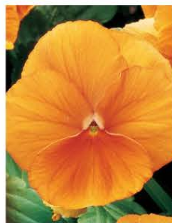
PANSY SPRING MATRIX DEEP ORANGE