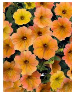
PETUNIA CASCADIAS INDIAN SUMMER