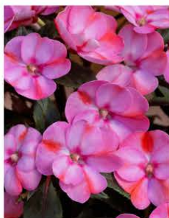
SUNPATIEN COMPACT PINK CANDY