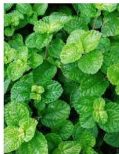
MINT PEPPERMINT UPRIGHT