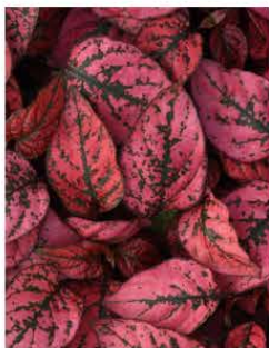
HYPOESTES SPLASH SELECT ROSE

Glacier - gray-green with white variegation.