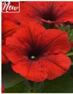
PETUNIA PREMIUM E3 EASY WAVE RED