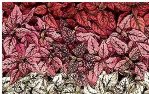
HYPOESTES SPLASH SELECT MIX