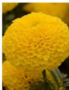
MARIGOLD TAISHAN YELLOW