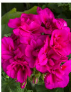
GERANIUM CALLIOPE MEDIUM VIOLET