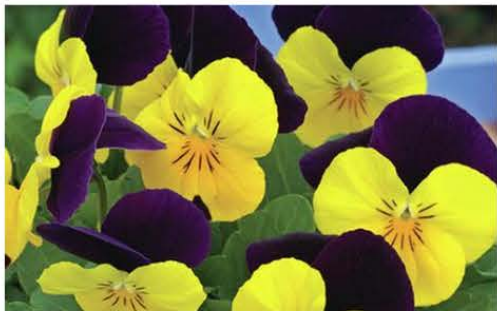
VIOLA PENNY YELLOW JUMP UP