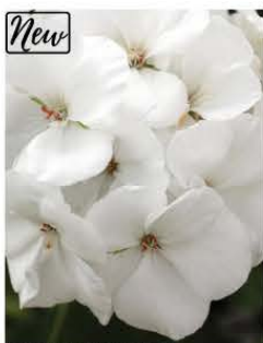
GERANIUM CALLIOPE MEDIUM WHITE