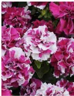
PETUNIA DOUBLE MADNESS ROSE AND WHITE