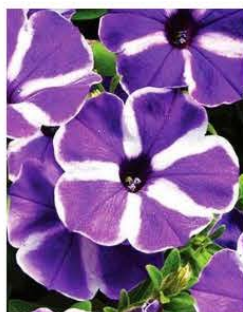
PETUNIA CASCADIAS PURPLE GEM