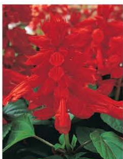
SALVIA VISTA RED