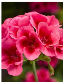
GERANIUM CALLIOPE MEDIUM ROSE MEGA SPLASH