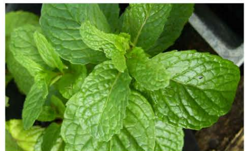
MINT SPEARMINT KENTUCKY COLONEL