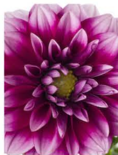
DAHLIA LABELLA MEDIO FUN PINK BLUSH