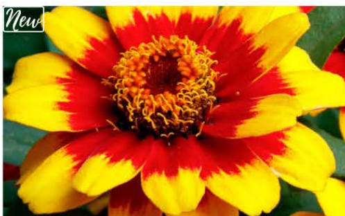
ZINNIA PROFUSION RED YELLOW BICOLOR