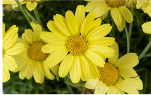
ARGYRANTHEMUM SUNNY SPRING