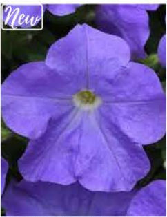
PETUNIA PREMIUM E3 EASY WAVE SKY BLUE