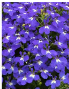
LOBELIA HOT BLUE