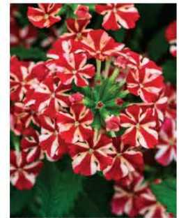
VERBENA VOODOO RED STAR