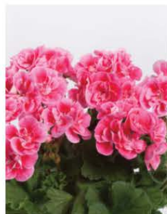
GERANIUM DARKO SPANISH WINE ROSÉ