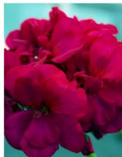
GERANIUM DARCO NEON PURPLE