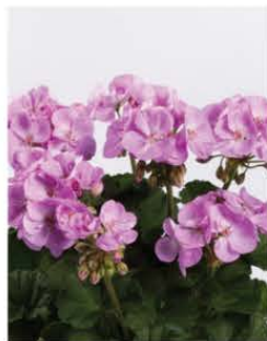
GERANIUM DARKO BLUE