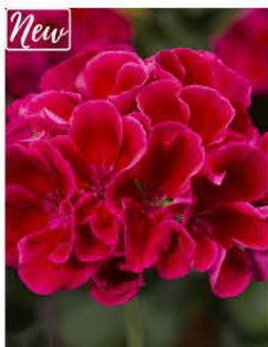
GERANIUM CALLIOPE MEDIUM CRIMSON FLAME