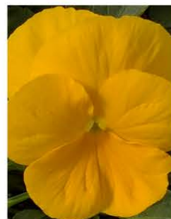
VIOLA COLORMAX CLEAR YELLOW