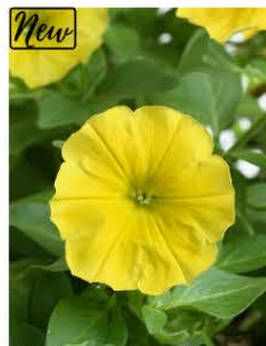
PETUNIA CAPELLA HELLO YELLOW