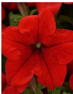
PETUNIA PRETTY GRAND RED