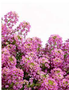
LOBULARIA STREAM RASPBERRY