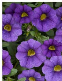
CALIBRACHOA NOA BLUE LEGEND