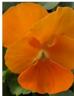
VIOLA COLORMAX CLEAR ORANGE