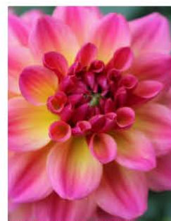
DAHLIA HYPNOTICA ROSE BICOLOR