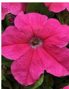
PETUNIA PRETTY GRAND PINK DEEP