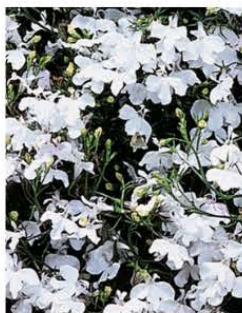
LOBELIA REGATTA WHITE