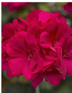
GERANIUM CALLIOPE MEDIUM HOT PINK