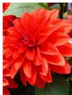
DAHLIA HYPNOTICA RED