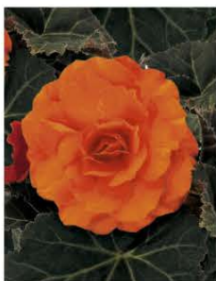
BEGONIA NONSTOP MOCCA DEEP ORANGE