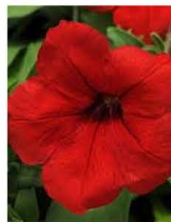
PETUNIA PRETTY FLORA RED