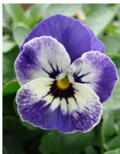
VIOLA SORBET XP DELFT BLUE