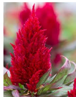
CELOSIA NEW LOOK