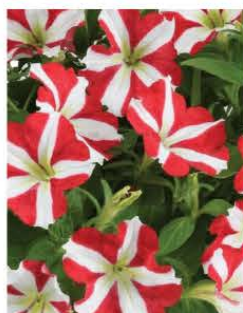
PETUNIA AMORE KING OF HEARTS