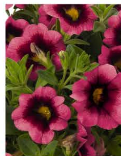
CALIBRACHOA HULA HOT PINK