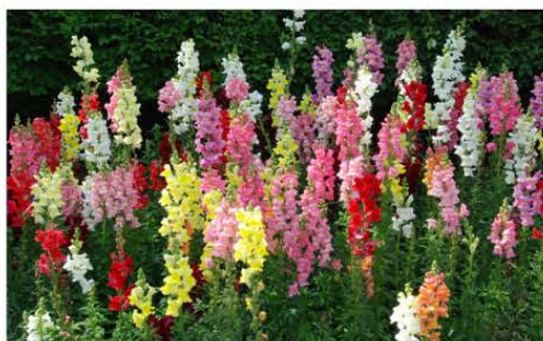
SNAPDRAGON ROCKET MIX