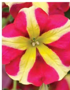
PETUNIA AMORE QUEEN OF HEARTS