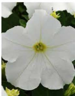
PETUNIA PRETTY GRAND WHITE