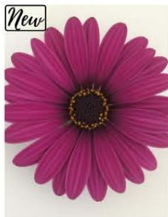
OSTEOSPERMUM GELATO PRUNE