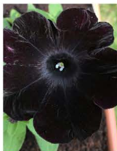
PETUNIA RAY BLACK