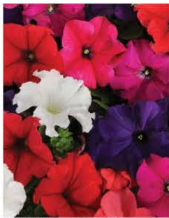
PETUNIA PRETTY GRAND MIX FORMULA