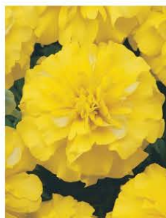
MARIGOLD BONANZA YELLOW