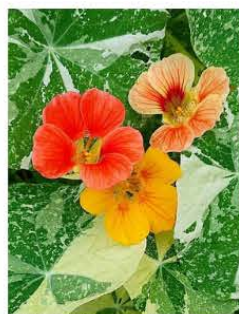
NASTURTium ALASKA MIX