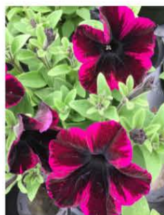
PETUNIA CRAZYTUNIA COSMIC PURPLE