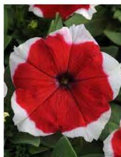
PETUNIA DREAMS RED PICOTEE