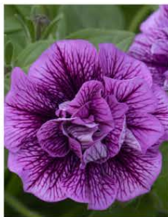
PETUNIA VERANDA DOUBLE SUGAR PLUM

NEW Splash Dance Bolero Blue - For the "starry" look in your eyes, this speckled blue and white pattern holds its unique coloration into the heat. Has a compact, trailing habit. Use in 4-1/2" up to large containers, hanging baskets or ground covers. Propagation prohibited.