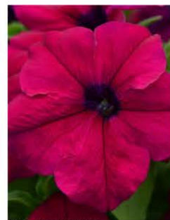
PETUNIA DREAMS BURGUNDY