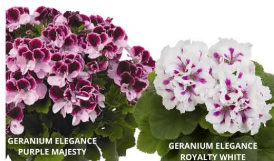
GERANIUM ELEGANCE PURPLE MAJESTY