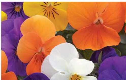
VIOLA PENNY LANE MIX