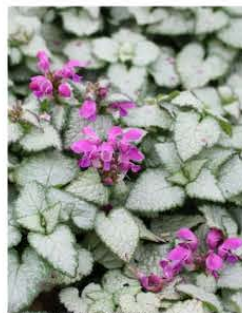
LAMIAM BEACON SILVER