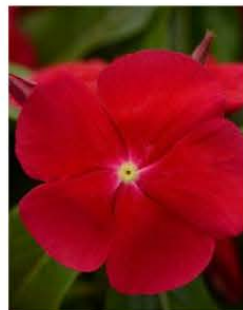
VINCA TITAN REALLY RED