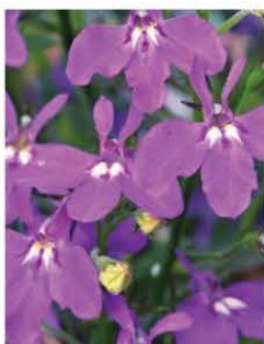
LOBELIA HOT PURPLE