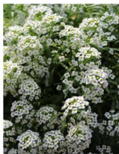
LOBULARIA STREAM WHITE