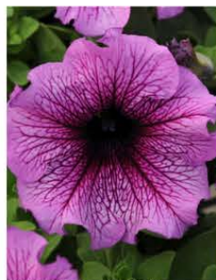
PETUNIA DADDY SUGAR