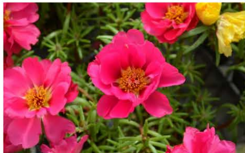
PORTULACA HAPPY HOUR FUCHSIA