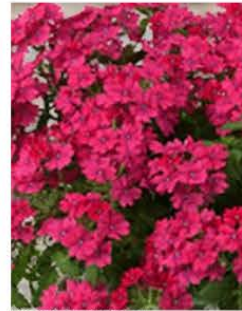
VERBENA VANESSA COMPACT NEON PINK