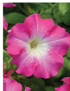
PETUNIA DREAMS ROSE MORN