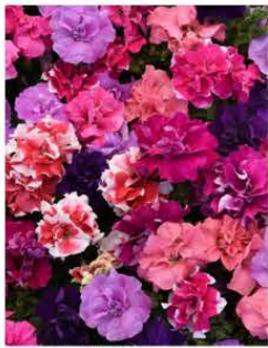
PETUNIA DOUBLE MADNESS MIX