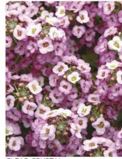
CLEAR CRYSTAL LAVENDER SHADES