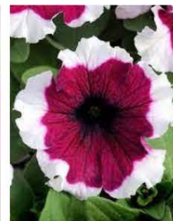
PETUNIA DREAMS BURGUNDY PICOTEE