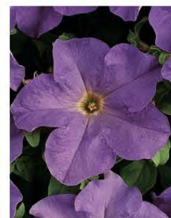
PETUNIA DREAMS SKY BLUE