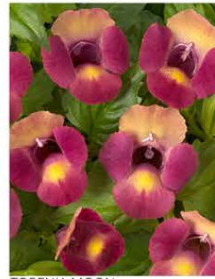
TORENTIA MOON MAGENTA