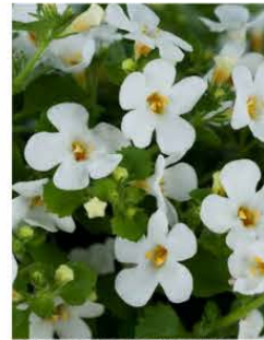
BACOPA SCOPIA GULLIVER COMPACT WHITE