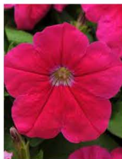
PETUNIA PRETTY FLORA PINK