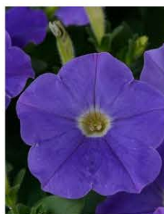
PETUNIA RAY CLASSIC BLUE