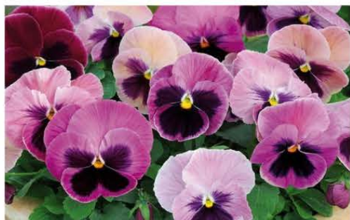
PANSY SPRING MATRIX PINK SHADES