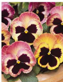
PANSY MATRIX SUNRISE