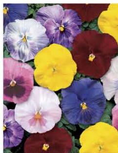
PANSY DELTA MIX MONET