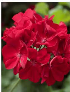
GERANIUM CALLIOPE MEDIUM DARK RED