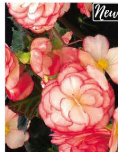
BEGONIA NONSTOP ROSE PICOTEE