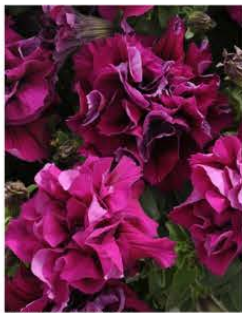
PETUNIA DOUBLE MADNESS BURGUNDY