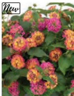
LANTANA HEARTLAND SUNRISE