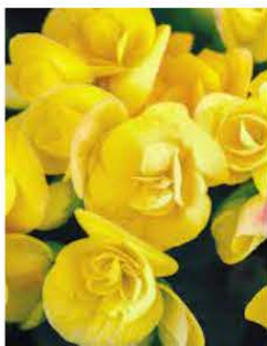
BEGONIA SOLENIA YELLOW