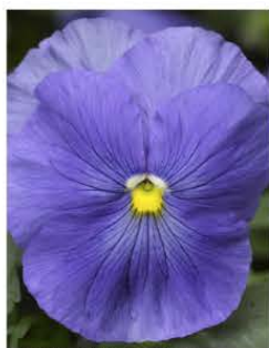
PANSY DELTA PREMIUM TRUE BLUE