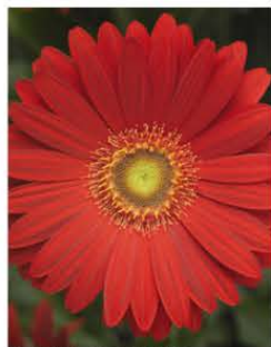
GERBERA JAGUAR RED LIGHT EYE