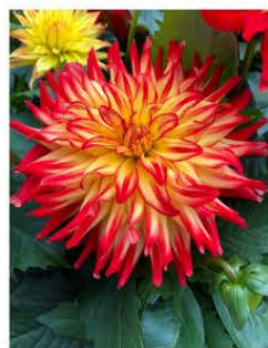
DAHLIA HYPNOTICA ICARUS