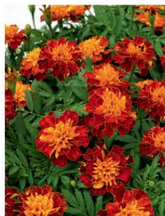
MARIGOLD SUPER HERO HARMONY