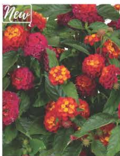
LANTANA HEARTLAND NEON