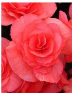
BEGONIA SOLENIA DARK PINK