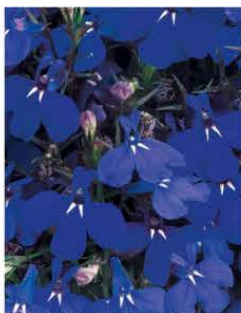
LOBELIA RIVIERA MARINE BLUE