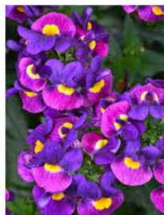
NEMESIA ESSENTIAL SUGARBERRY