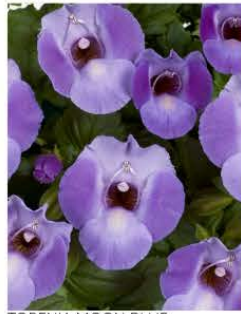
TORENTIA MOON BLUE