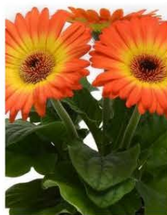
GERBERA REVOLUTION BICOLOR YELLOW ORANGE