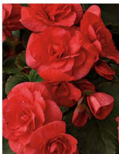
BEGONIA SOLENIA SCARLET