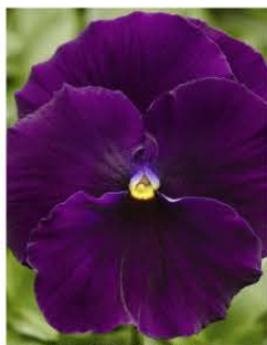
PANSY DELTA PREMIUM PURE VIOLET