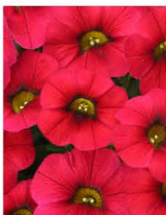
CALIBRACHOA CALITASTIC RED LIPS