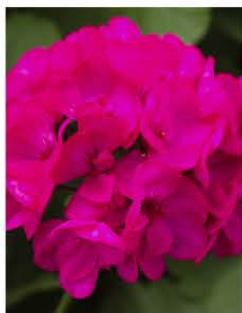
GERANIUM CALLIOPE MEDIUM DEEP ROSE