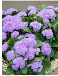
AGERATUM ALOHA BLUE