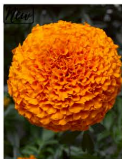
MARIGOLD INCA II DEEP ORANGE