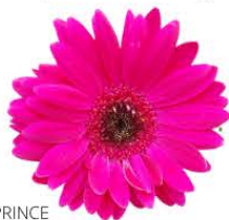
GERBERA ROYAL PRINCE NEON VIOLET

Royal Prince Neon Violet - Shimmering violet with a dark eye. The Royal gerberas are noted for their "spiral staircase" flowering habit, buds and blooms forming a spiral of continued color. Ideal for 4" production. Height approx 10" tall.