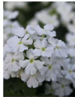
VERBENA VANESSA COMPACT WHITE