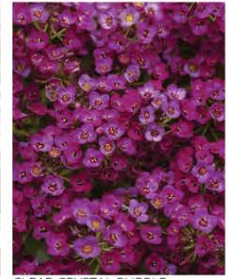
CLEAR CRYSTAL PURPLE SHADES