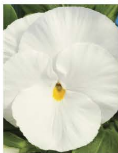
PANSY DELTA PREMIUM PURE WHITE