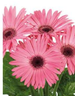
GERBERA FLORI LINE MAXI PINK BLACK CENTER