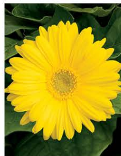
GERBERA JAGUAR YELLOW LIGHT EYE