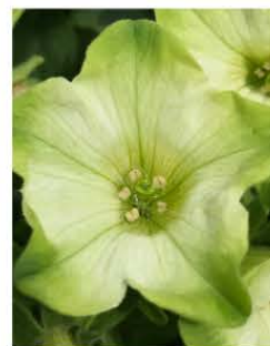
PETUNIA RAY PISTACHIO CREAM