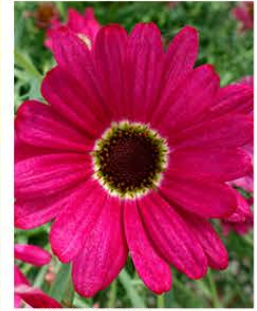
ARGYRANTHEMUM GRANDAISY DARK PINK