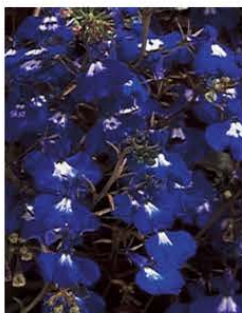
LOBELIA REGATTA MIDNIGHT BLUE