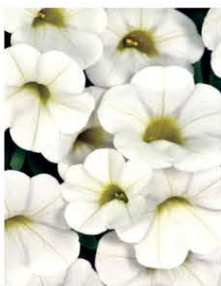
CALIBRACHOA CALITASTIC WHITE