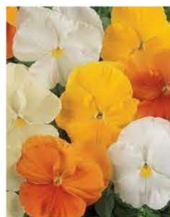
PANSY MATRIX MIX CITRUS