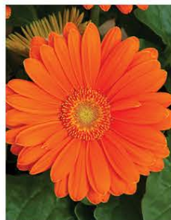
GERBERA JAGUAR TANGERINE LIGHT EYE