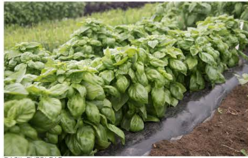
BASIL EVERLEAF GENOVESE

Italian ( Origanum x majoricum ) - A cross between sweet marjoram and the more piquant wild marjoram, Italian oregano yields a milder flavor than Greek oregano. Probably the most popular culinary oregano. Use the leaves fresh or dry. Height 18-24".