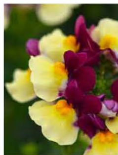
NEMESIA ESSENTIAL RASPBERRY CUSTARD