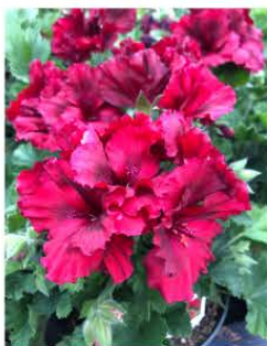
GERANIUM ELEGANCE CLARET