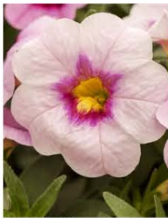
CALIBRACHOA CALIBASKET PINK DOLL