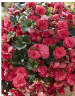
BEGONIA VERMILLION HOT PINK