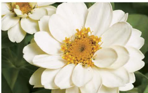
ZINNIA PROFUSION WHITE