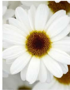
ARGYRANTHEMUM GRANDAISY WHITE