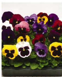
PANSY MATRIX MIX BLOTCH