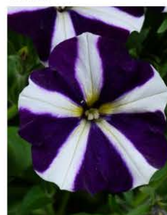
PETUNIA AMORE PURPLE