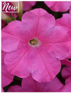
PETUNIA PREMIUM E3 EASY WAVE PINK