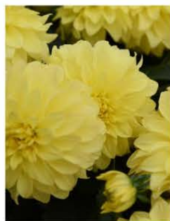
DAHLIA HYPNOTICA YELLOW