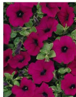
PETUNIA WAVE PURPLE CLASSIC