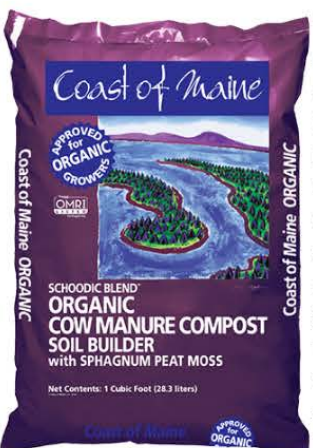
10225047 - 1 cuft

Coast of Maine Organic Products Quoddy Blend Lobster Compost is made with lobster shells, compost and sphagnum peat moss. It is a dark-brown, complex soil filled with everything your plants need for healthy growth. It drains well and is an ideal soil conditioner for existing beds that need reinvigorating. It is OMRI listed for use in organic gardens.