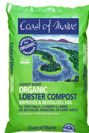
10225045 - 1 cuft

Coast of Maine Stonington Blend Grower's Mix is a complex "super soil" designed for high performance container growing. It works well with tomatoes, and, where growing cannabis and medical marijuana is legal, growers have reported tremendous results. This soil incorporates mycorrhizal fungi, kelp, fish bone and alfalfa meal, as well as worm castings, peat, coir and lobster compost.