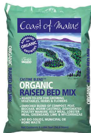
10225081 - 2 cuft

Coast of Maine Organic Products Bar Harbor Blend Organic Potting Soil is a lightweight soil mixture made with salmon, blueberry, lobster and other composts, as well as calcium and chitin-rich lobster shells, sphagnum peat, perlite and kelp meal. It is dark brown in color and provides the perfect balance between water retention and drainage needed for healthy plants. It is OMRI listed for use in organic gardens.