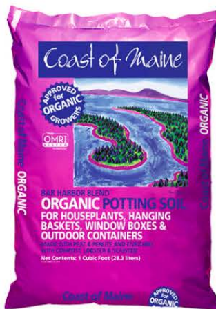
10225051 - 2 cuft 10225053 - 1 cuft