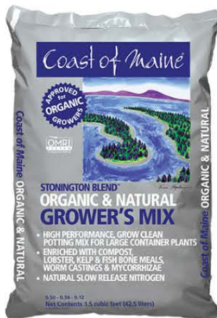
10225058 - 1.5 cuft

Coast of Maine Organic Products Castine Blend Organic Raised Bed Mix is a rich and diverse soil for growing big and healthy vegetables, herbs and flowers. It is made with a mixture of manure compost, worm castings, lobster and kelp meals, mycorrhizae, greensand and biochar. It is ready to use straight out of the bag with no need for additional components or tilling. It is OMRI listed for use in organic gardens.