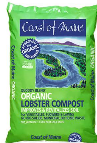
10225045 - 1 cuft

Coast of Maine Stonington Blend Organic Grower's Mix Coast of Maine Stonington Blend Grower's Mix is a complex "super soil" designed for high performance container growing. It works well with tomatoes, and, where growing cannabis and medical marijuana is legal, growers have reported tremendous results. This soil incorporates mycorrhizal fungi, kelp, fish bone and alfalfa meal, as well as worm castings, peat, coir and lobster compost.