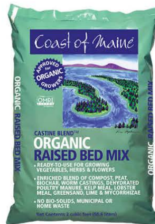
10225081 - 2 cuft

Coast of Maine Bar Harbor Blend Organic Potting Soil Coast of Maine Organic Products Bar Harbor Blend Organic Potting Soil is a lightweight soil mixture made with salmon, blueberry, lobster and other composts, as well as calcium and chitin-rich lobster shells, sphagnum peat, perlite and kelp meal. It is dark brown in color and provides the perfect balance between water retention and drainage needed for healthy plants. It is OMRI listed for use in organic gardens.