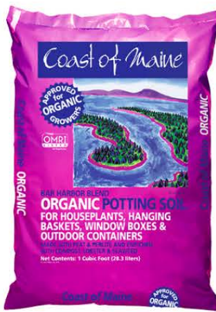
10225051 - 2 cuft 10225053 - 1 cuft

Coast of Maine Bar Harbor Blend Organic Potting Soil Coast of Maine Organic Products Bar Harbor Blend Organic Potting Soil is a lightweight soil mixture made with salmon, blueberry, lobster and other composts, as well as calcium and chitin-rich lobster shells, sphagnum peat, perlite and kelp meal. It is dark brown in color and provides the perfect balance between water retention and drainage needed for healthy plants. It is OMRI listed for use in organic gardens.