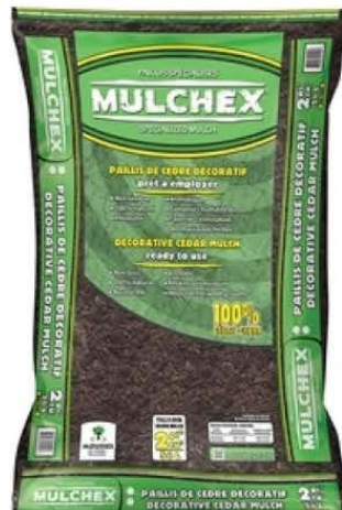
10205370 - 3 cuft