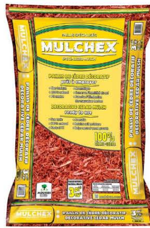
10201659 - 3 cuft