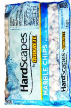
7486251 - 0.5 cuft

All natural decorative stones provide a beautiful look to your outdoor space while simultaneously preventing weed growth, stopping erosion and providing drainage. *