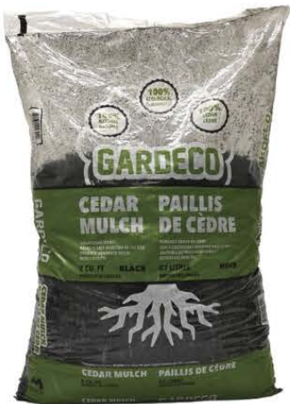
10204998 - 3 cuft