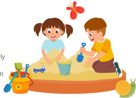
58173 - 50 lb

QUIKRETE® Premium Play Sand® is a specially graded washed sand that has been screened for children's sand boxes.