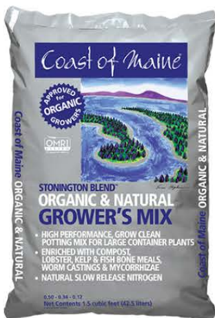
10225058 - 1.5 cuft

Coast of Maine Castine Blend Organic Raised Bed Mix Coast of Maine Organic Products Castine Blend Organic Raised Bed Mix is a rich and diverse soil for growing big and healthy vegetables, herbs and flowers. It is made with a mixture of manure compost, worm castings, lobster and kelp meals, mycorrhizae, greensand and biochar. It is ready to use straight out of the bag with no need for additional components or tilling. It is OMRI listed for use in organic gardens.