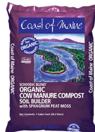
10225047 - 1 cuft

Coast of Maine Quoddy Blend Lobster Compost Coast of Maine Organic Products Quoddy Blend Lobster Compost is made with lobster shells, compost and sphagnum peat moss. It is a dark-brown, complex soil filled with everything your plants need for healthy growth. It drains well and is an ideal soil conditioner for existing beds that need reinvigorating. It is OMRI listed for use in organic gardens.