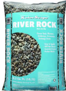
7166184 - 0.5 cuft

Kolorscape Decorative stone can be used with flower beds, planters, walkways, driveways and drainage areas.