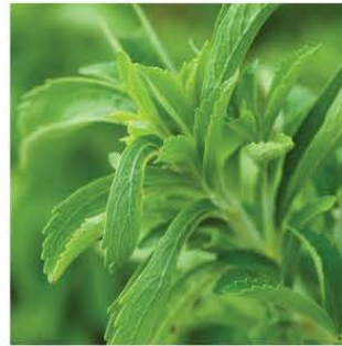
Stevia Sweet Leaf