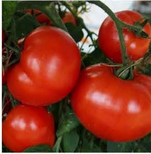
Tomato Early Girl Plus