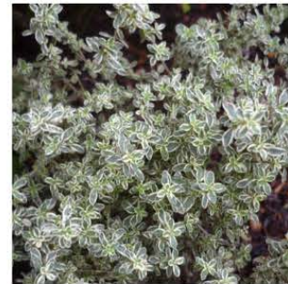
Thyme Silver Edged