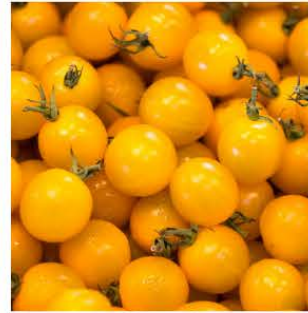
Tomato Sun Sugar