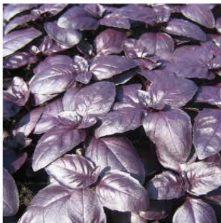
Basil Crimson King