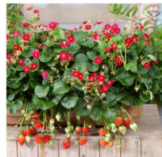
Strawberry Summer Breeze Rose