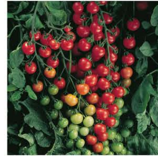
Tomato Super Sweet 100