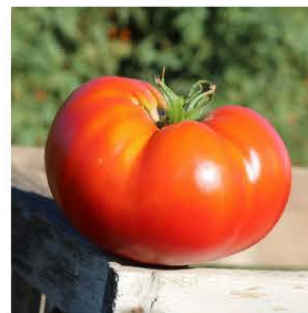
Tomato Better Boy Plus