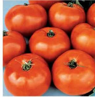
Tomato Jet Star