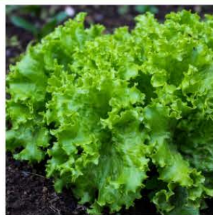
Lettuce Black Seeded Simpson