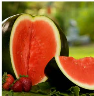
Watermelon Sugar Baby