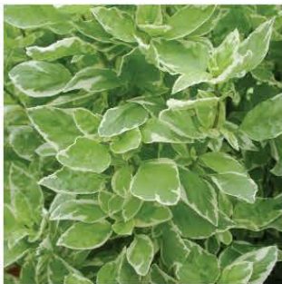
Basil Pesto Perpetuo

Onion - Like a grass onion, this herb is excellent for seasoning—especially good with potatoes and eggs. Height 12-18".