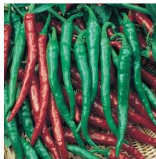
Pepper Cayenne Long Thin