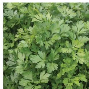
Parsley Giant of Italy