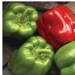
Pepper Better Belle V