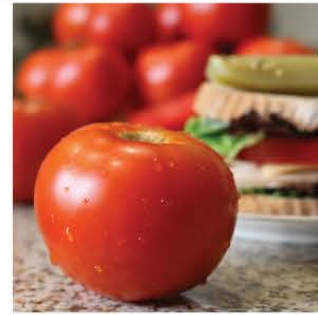
Tomato Celebrity Plus