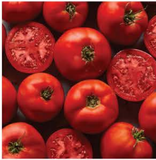
Tomato Burpee Big Boy