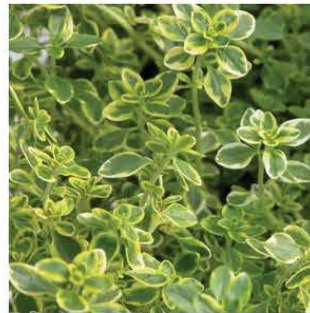
Thyme Golden Lemon