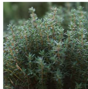
Thyme Vulgaris French