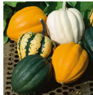
Winter Squash Autumn Acorn Blend