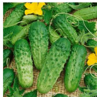
Cucumber Pick a Bushel