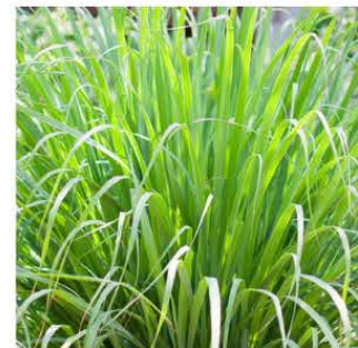
Cymbopogon Lemon Grass