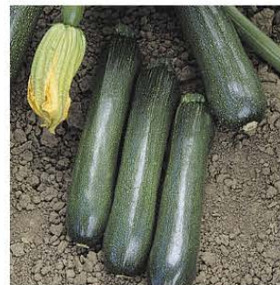
Summer Squash Ball's Zucchini