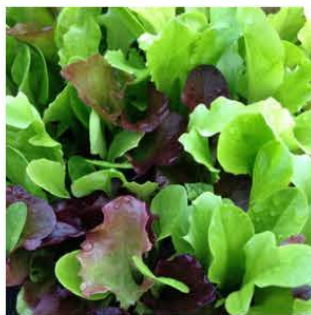
Lettuce Mesclun Baby Leaf