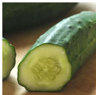
Cucumber Patio Snacker