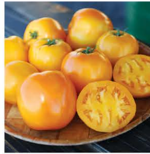
Tomato Carolina Gold