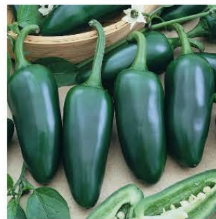
Pepper Jalapeno M