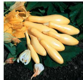
Summer Squash Multipik