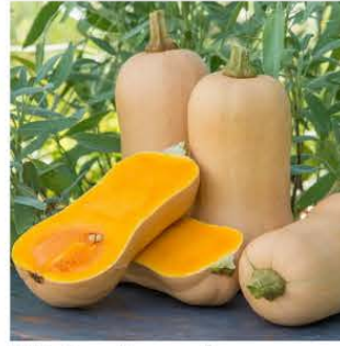
Winter Squash Butternut Canesi