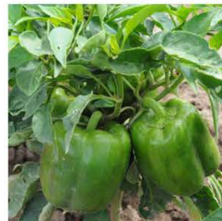
Pepper California Wonder