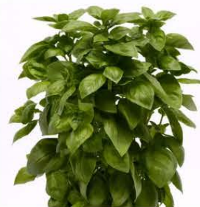
Basil Everleaf Genovese