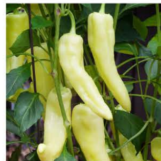
Pepper Sweet Banana