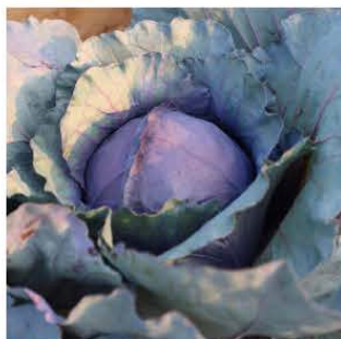
Cabbage Red Jewel