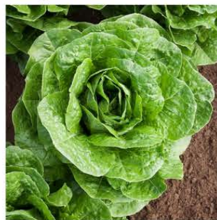
Lettuce Parris Island Cos