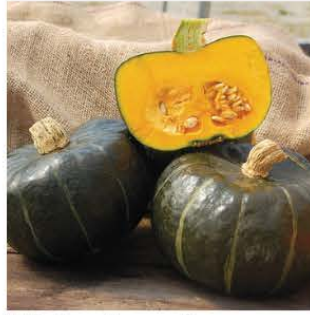
Winter Squash Buttercup