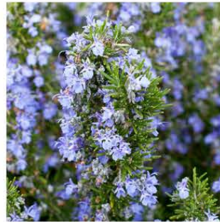
Rosemary Tuscan Blue