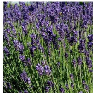
Lavender Vincenza Blue