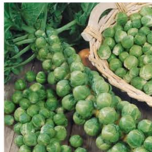
Brussel Sprouts Long Island Green