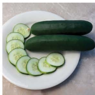
Cucumber Slice More