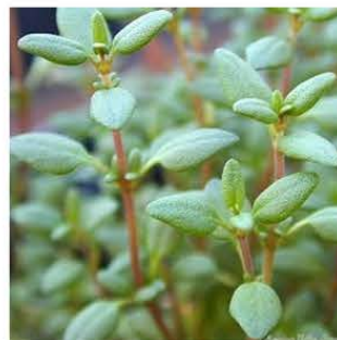
Thyme Vulgaris English