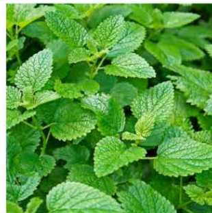
Melissa Lemon Balm