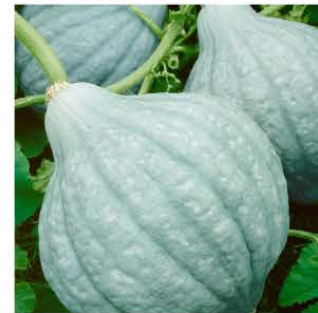
Winter Squash Blue Hubbard