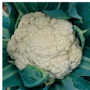
Cauliflower Snow Crown