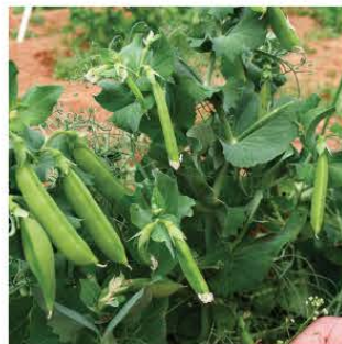
Peas Sugar Lace