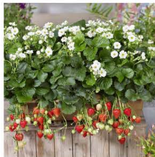
Strawberry Summer Breeze Snow