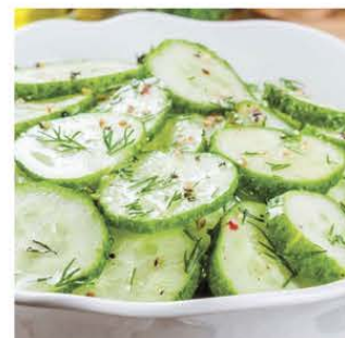
Cucumber Saladmore Bush