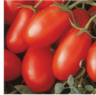
Tomato La Roma 3.5