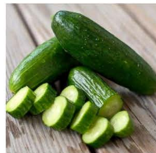
Cucumber Beit Alpha