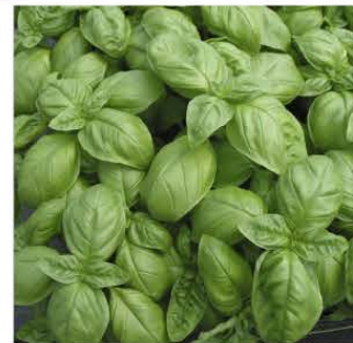
Basil Nufar Sweet