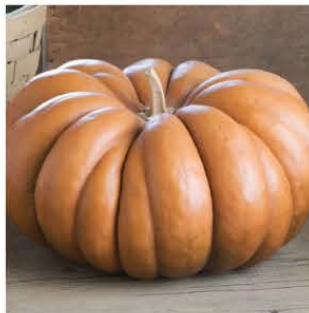
Pumpkin Fairy tale