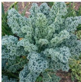
Kale Scotch Blue Curled