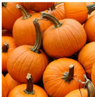
Pumpkin Small Sugar