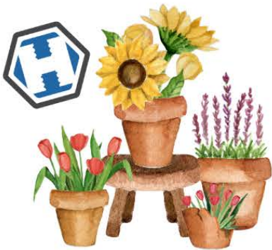
7293277 - 0.5 cuft

Decorative stones provide a beautiful look to your outdoor space while simultaneously preventing weed growth, stopping erosion and providing drainage.