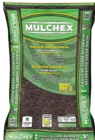
10205370 - 3 cuft