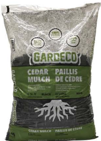
10204998 - 3 cuft