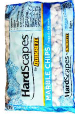
7486251 - 0.5 cuft

All natural decorative stones provide a beautiful look to your outdoor space while simultaneously preventing weed growth, stopping erosion and providing drainage. *