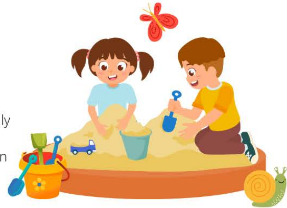
58173 - 50 lb

QUIKRETE® Premium Play Sand® is a specially graded washed sand that has been screened for children's sand boxes.