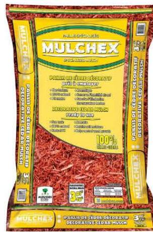
10201659 - 3 cuft